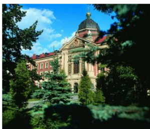
CUE Main Building