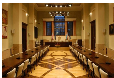
CUE Senate Hall